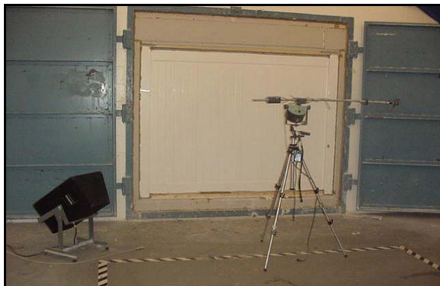
Photograph of Vinyl Fence in test wall – Perimeter Sealed

The specimen was described as being a Vinyl Fence section. The fence measured 102" x 74" x 1" and weighed 71 lbs. The fence contained two end posts, upper rail, lower rail and 8 interior panels. The interior panels were tongue & groove interlocking members. The fence assembly was mounted in the test wall with the perimeter sealed.